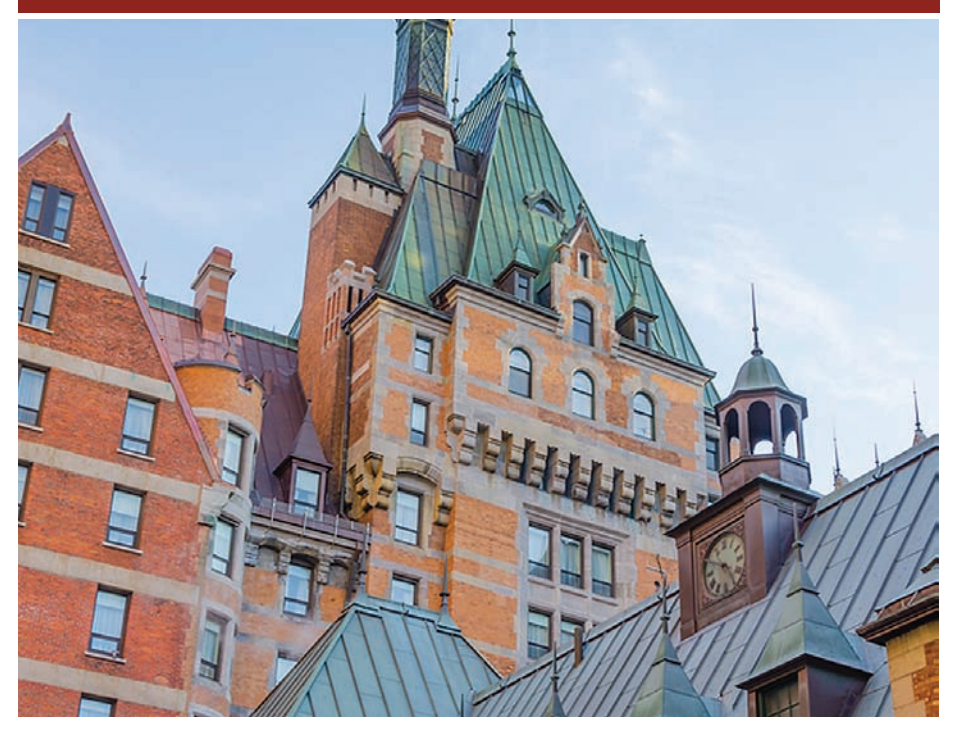
SEPTEMBER 27 - 30, 2015 - QUEBEC CITY