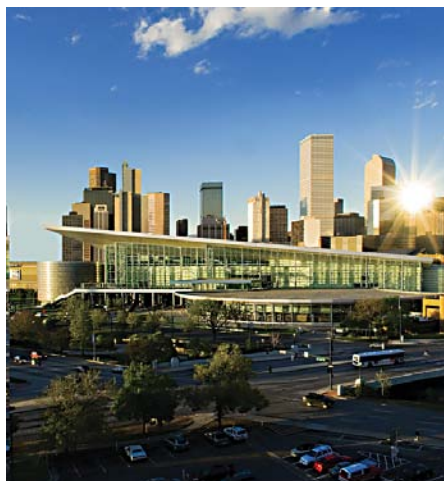
Colorado Convention Centre: Denver

Please consider attending the RIMS Annual Conference in Denver, Colorado from April 27-30, 2014.