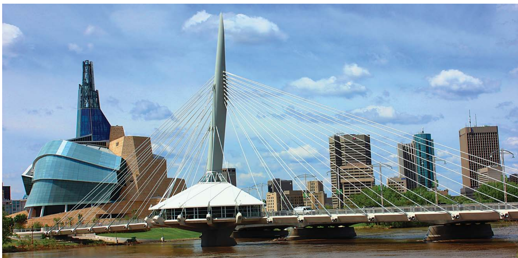
Winnipeg Esplanade Riel Bridge