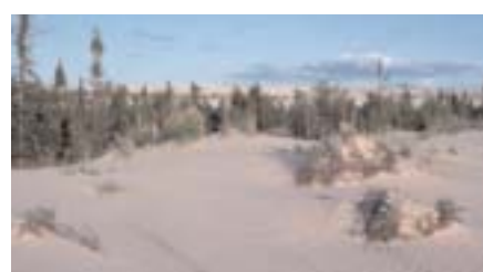
Athabasca Sand Dunes

commercial aircraft in Canada registered in Regina