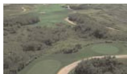
Dakota Dunes Golf Course