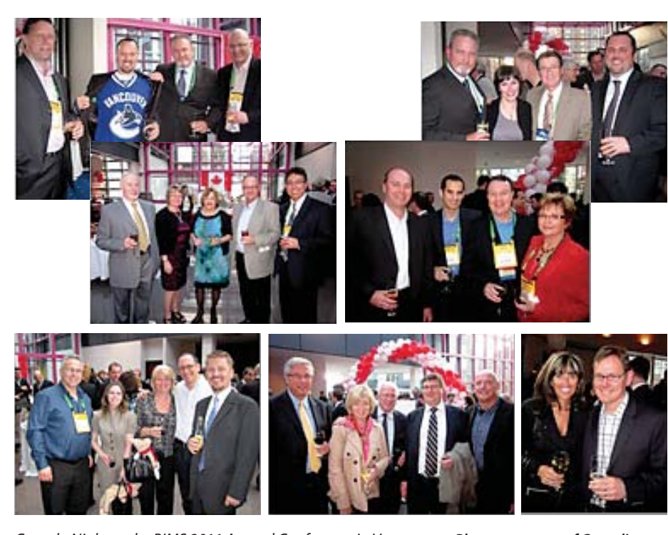
Canada Night at the RIMS 2011 Annual Conference in Vancouver.