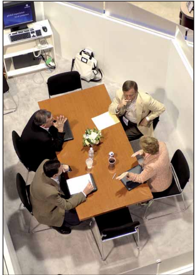
Exhibit Hall Events

Please note: RIMS non-solicitation policy limits solicitation of business in the exhibit hall and all other areas occupied by the conference to those companies that reserve exhibit space. We reserve the right to expel individuals that do not adhere to the policy. Admission to the Exhibit Hall is limited to conference registrants and exhibitor personnel with badges. Individuals under the age of 21 will not be admitted.