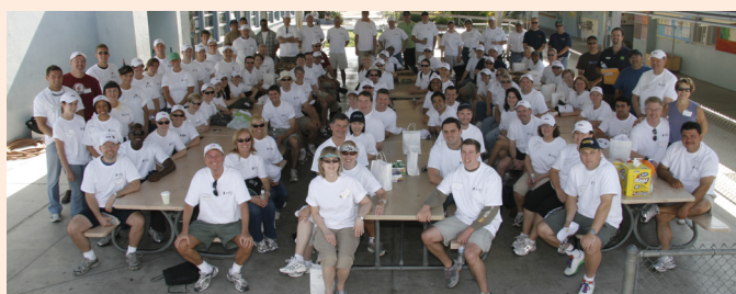
More than 200 attendees participated in RIMS Community Service Day, renovating and beautifying San Diego's King Chavez Academy school grounds.