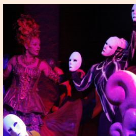
"Cirque Dreams" entertainment event