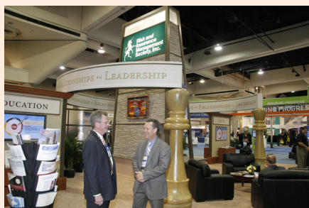
RIMS booth in the Exhibit Hall