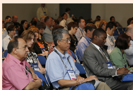
Attendees enjoy a session