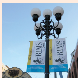
San Diego welcomes RIMS

Each year, RIMS Conference Programming Committee partnering with Meeting & Events staff, exceeds expectations, bringing members (and non-members) the latest and greatest in professional development, networking, new products and services, and social events. Visit www.RIMS.org/RIMS2009 and start planning your trip—this time to Orlando—for RIMS 2009 in April!