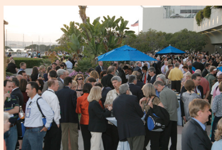
Networking at RIMS opening reception—a good time for all!

welcome to RIMS membership! This is the first of four quarterly newsletters that you, as a new RIMS member, can look forward to receiving over the coming months. We want all of our members, but particularly our new members, to be aware of the products, services, programs and benefits that RIMS offers. This issue will focus on our online and staff resources.