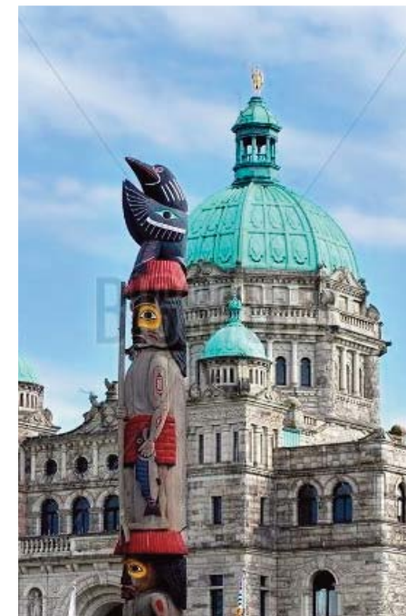
Parliament buildings Victoria, BC

We would be honoured to have you visit the RIMS Canada Council booth which we are very pleased to share with our friends and colleagues